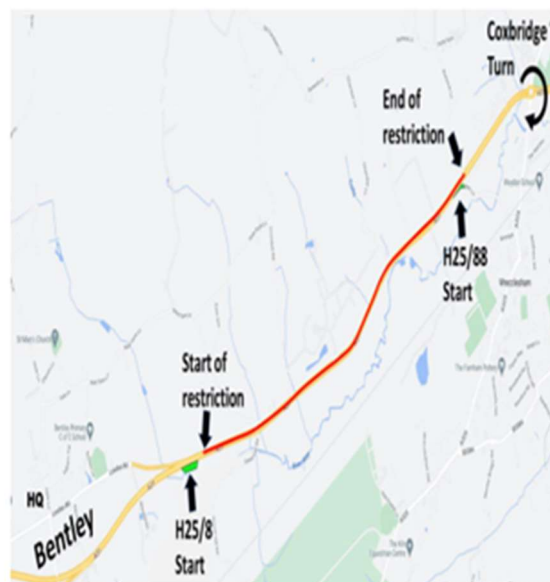
Map of the A31 eastbound width restriction

For a larger map, see: https://www.londonwestdc.co.uk/files/ugd/067d8e_4605bc3ce93442a0a2770250465ad005.pdf